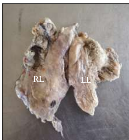
Figure 2:Thymus- Anterior view RL-Right lobe, LL- Left lobe

with moderate built during routine PG dissection of thoracic region at Department of Rachana Sharir, Sri Dharmasthala Manjunatheshwara College of Ayurveda and Hospital, Hassan, Karnataka, India. It was the first case of variation in size of Thymus gland we found among 30 cadavers dissected at our department since 2011.