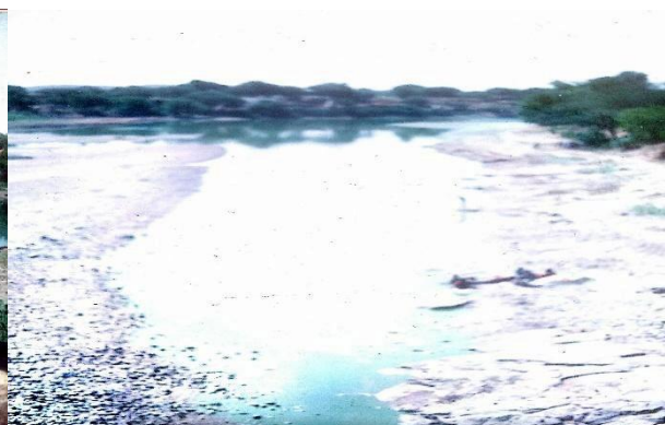
Plate VI – Bhima river (Khed)