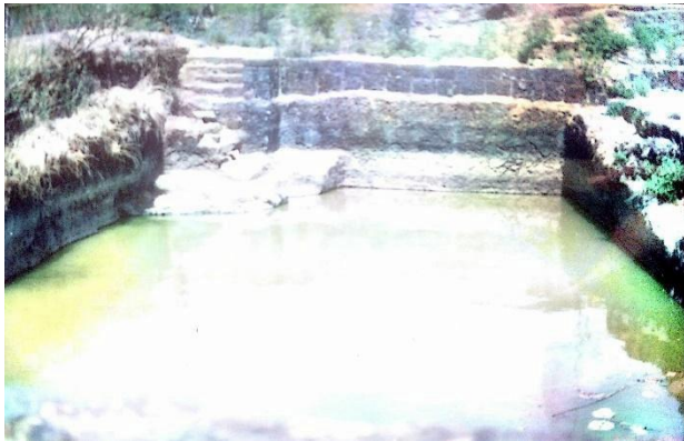
Plate VII – Sinhgad entry gate pond

ENTRY GATE POND: This pond lies in the close vicinity of the main gate (Pune gate) of the fort. The pond is well constructed and rectangular in shape. The pond measure about 150 feet in length, 75 feet in breadth and 25 feet in depth. The pond is provided with steps. The pond water is used for washing of cloths and cleaning of utensils by residents of the fort. (Plate-VII,VIII).