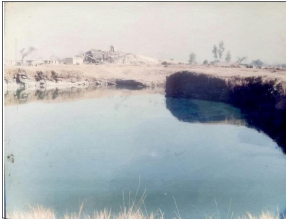
Plate III – Dehu Road Pond - B