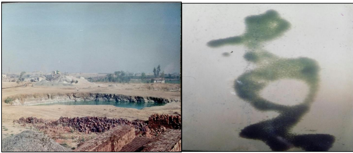
Plate I – Dehu Road Pond - A

POND-A: This is comparatively a smaller pond that lies about 50 meters East of new Pune-Mumbai Highway. The pond is roughly wedged shaped. Towards its narrow region, it is about 25 feet in breadth. The measured depth of the pond was 20 feet . This is a permanent water body with permanent bloom of Microcystis . During monsoon the water of the pond is used for washing of cloths and cleaning of vehicles. ( Plate- I, II).