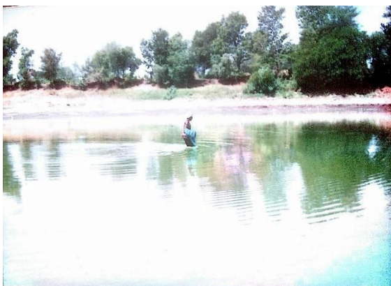
Plate IX - Bhima river: Fish catch

Chacko, (1954) while studying fish pounds in Tamilnadu, reported several instances of O 2 depletion and large scale mortality of fishes and other Fauna causing considerable damage and loss to fish farms and fish farmers in Tamilnadu. However, such mortality of fish as well as direct toxic effect of Microcystis did not encounter during the study. (Plate- IX , Graph- I).