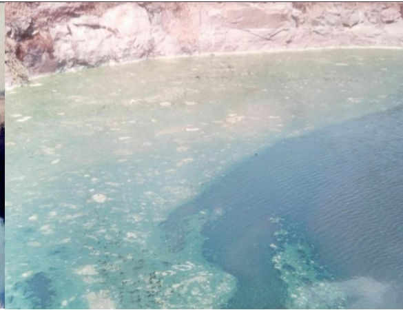
Plate IV – Microcystis bloom

POND-C: This is a much bigger and deeper pond in contrast to the pond described earlier. This water body is oblong in shape and measure about 500 feet in length, 300 feet in breadth. A big crusher unit is located next to the pond whose dust blows intermittently over the pond. This pond water is also used for the washing of cloths, utensils, and bathing.