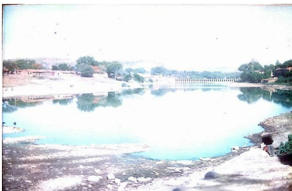
Plate V – Khed (Rajgurunagar) : Bhima river

THE BHIMA RIVER, KHED (RAJGURUNAGAR): The study site lies about 35k.m.North of Pune in the river Bhima near the town Rajgurunagar (khed) on Pune- Nasik Highway. The river Bhima originates at Bhimashankar and reaches Rajgurunagar after its journey of 75 k.m. On the river, near Rajgurunagar there are two Kolhapur type of bunds for the storage of water. The river stretches of almost 3 k.m. length exhibited thick bloom of Microcystis in the month of February, April and May, 1994. The river water is used for irrigation, fisheries, washing of cloths and utensils, recreation, cleaning of cattles and vehicles. (Plate-V,VI).