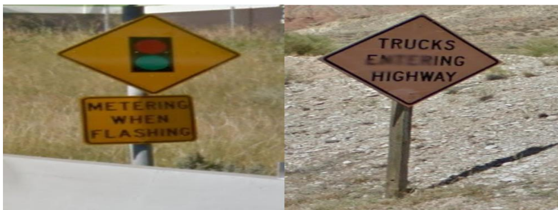
Figure: 1 Example of dirty traffic signs

Thusly, the experts gives a couple of gauges to street activity as movement signs like greatest speed restrict, isolate paths for typical vehicle or overwhelming vehicle, et cetera for various kind of streets. There is moreover a possibility of human eye distinguishing proof mistake for this activity signs order, consequently prompts street mishaps. Their needs a particular system to order these street activity signs for a computerized structure and will teach or alert drivers for different road movement signs like speed breaking point, et cetera., which will avert human eye identification botch. Vienna Convention on Road Signs and Signals is a settlement set apart in 1968 which has had the ability to organize movement signs transversely finished different countries. Around 52 countries have denoted this deal, which consolidates 31 countries from Europe. The custom has completely described the road signs into seven classes doled out with letters.