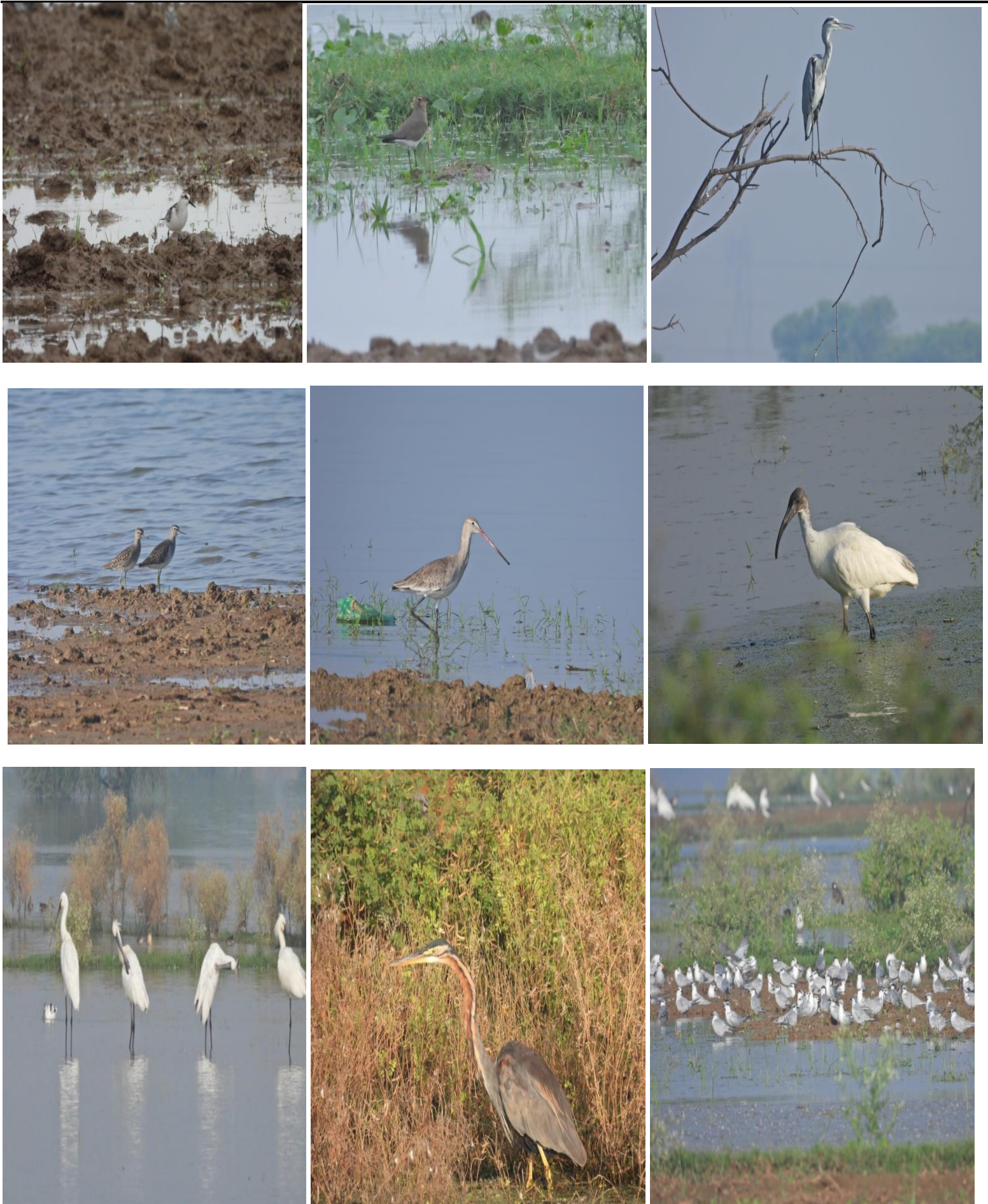
Figure 3. Some glimpses of Morel dam