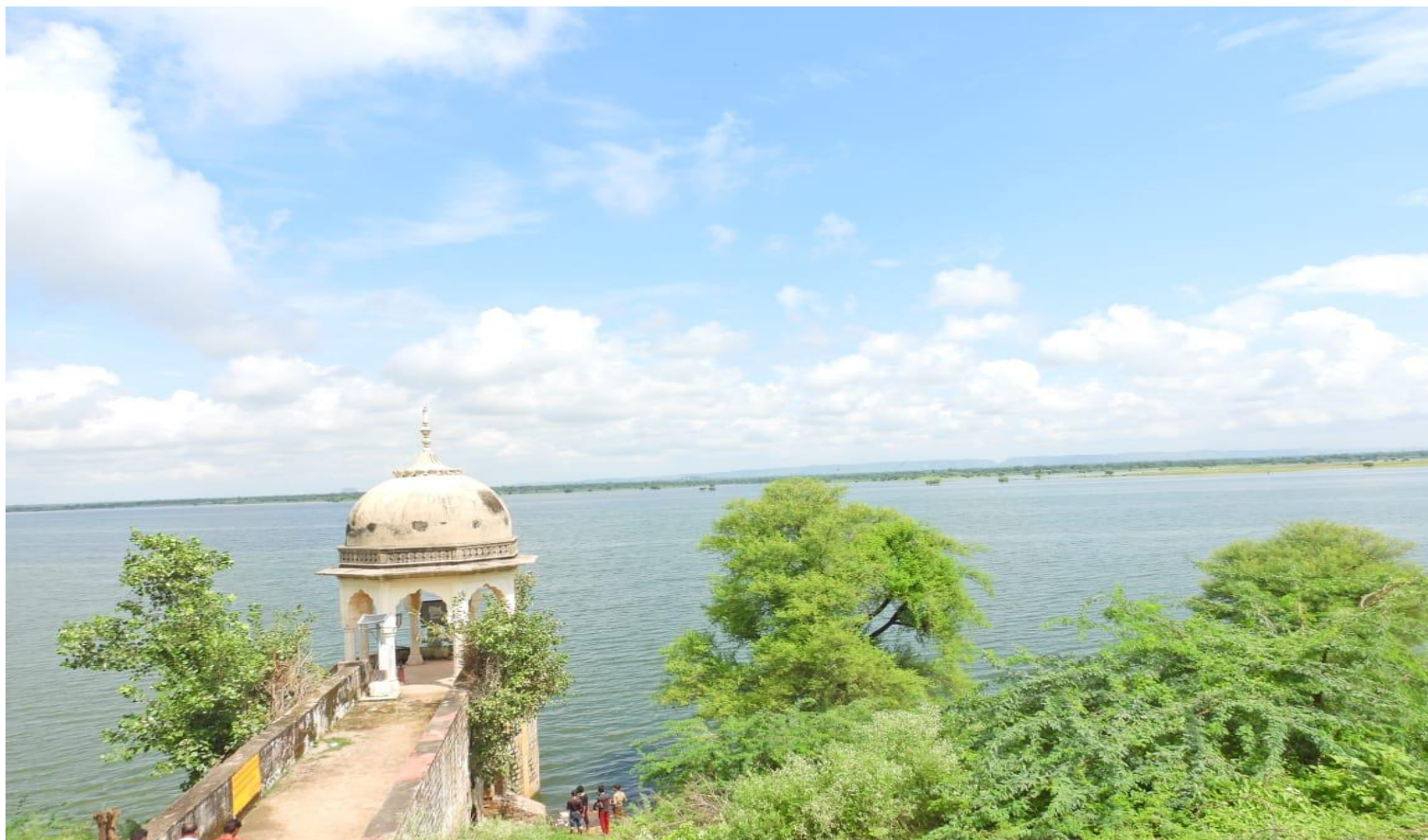
Figure 1. View of Morel dam