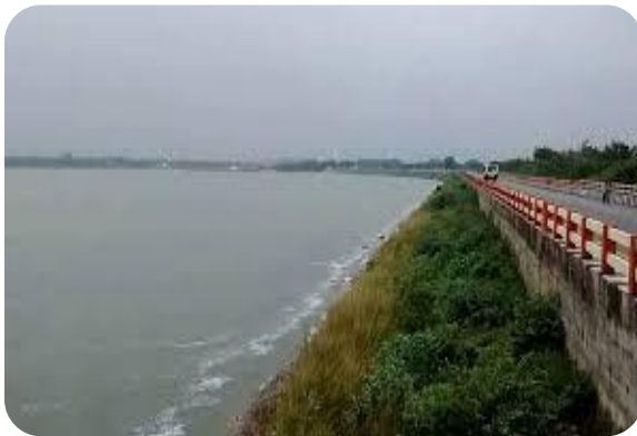
Fig.1. Palair reservoir