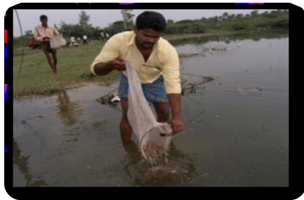
Fig.2 Stocking of seed