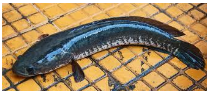
Fig.9. Channa striatus

The general fish and prawn production from Palair reservoir is 60 metric / annum (2004- 05) and the production of prawn touches 130 – one hundred forty five tonnes as against the 170 – 210 tonnes of fish (2010-13). The aquaculture production of this reservoir is representing the complete Telangana aqua production. In end the palair reservoir is a perennial reservoir with no water shortage. This favours the fishes to develop until the marketable size spherical the 12 months and not using a effect of seasonal fluctuations of water level. Local demand for Palair reservoir fish (Indian important carps, unusual and air respiration) could be very high for their particular taste. All those benefit the Palair reservoir for the improvement of culture primarily based reservoir. This reservoir is arbitrarily stocked with fries and fingerlings of principal carps of variable length and numbers. Hence it is important to stock the reservoir with CIFRI advocated top-rated size of 10 cm fingerlings (Selvaraj et al., 1995). The worldwide marketplace for scampi is increasing with