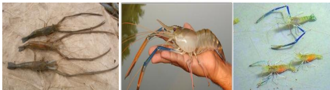
Fig. 5, Morphotypes of M.malcolmsonii Fig. 6. M.rosenbergii , Fig.7.Morphotypes of M.rosenbergii