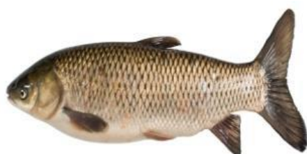
Fig.8. Grass carp