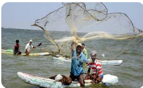
Fig. 3. Harvesting