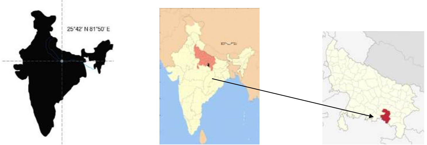
Figure 3: Geographical location of Allahabad

The study area is the city of Prayagraj in the state of Uttar Pradesh, India. It lies on coordinate 25.4500 °N, 81.8500 °E. Located in southern Uttar Pradesh, the city’s metropolitan area covers 63.07 km 2 . The population of Allahabad district in 2001 was 49 lakhs and in 2011 it was 59 lakhs according to census. It is connected by road to prominent cities of country like Jhansi, Kanpur, Lucknow, Jaipur, Bhopal, New Delhi etc. Buses operated by Uttar Pradesh and other state road transports corporation as important means of road transport. The four main stations in Allahabad are Prayag station, city station at Rambagh, Daraganj station and Allahabad junction. The city is connected to most of the Uttar Pradesh cities and other major cities like Chennai, Vishakhapatnam and New Delhi etc. Allahabad is served by Allahabad airport and inland waterways Authority of India connect Allahabad to Haldia. [6]