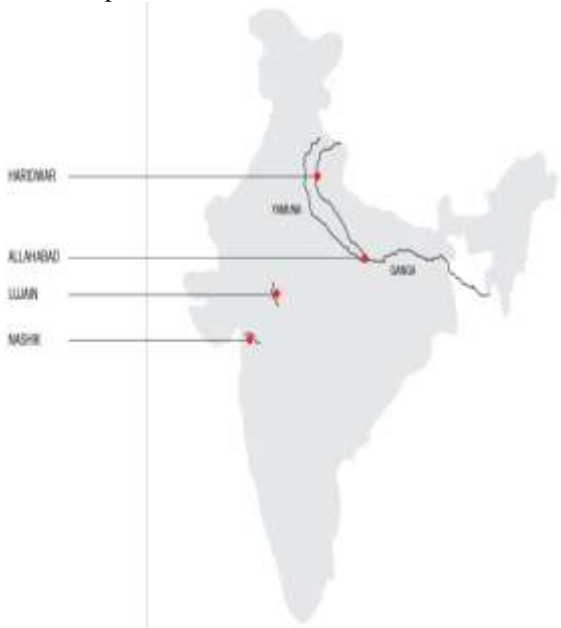
Figure 1 Location of Kumbh mela at all places in India

Cities constantly keep on changing, but these changes becomes challenges when changes are instantaneous, or they deviate significantly from planning projections, or something unexpected mass movement occurs. Role of planners is very significant to regulate city changes. Here in the case of kumbh mela which take place at every 6 years of time interval bringing tens of millions of devotees at a place where a large number of mass movement occurs, hence which increases the number of temporary settlements near the sangam. These poses a great challenge to the city planner as the large number of floating population is been seen with the increasing number of pilgrims every time the festival take place.