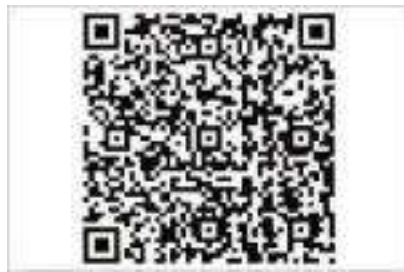
Fig. 1.1: Structure of QR code

Presently a day's practically all the things we can do on the web (like banking, shopping, conveying) and right now is that while doing this things online our data isn't get harmed. In fact, as the technique for deciphering the security code get increasingly unpredictable and ground-breaking. There is have to grow all the more remarkable security application. These incredible applications permit client to take a shot at untrusted PCs certainly. This work depends on the two way validation framework. Right now code gives security. QR code is the Quick Response code .The current framework having security techniques, for example, password, user name, biometrics, and face detection. In any case, in these strategies security isn't sufficient, so there is have to grow such security framework which gives high security. The ongoing enthusiasm for the utilization of visual labels in regular daily existence is a characteristic result of the innovative advances found in current cell Phones .The QR code is a framework comprising of a variety of array of nominally square modules orchestrated in a general square example, including an extraordinary example situated at three corners of the image and proposed to aid simple area of its position, size and tendency .A wide scope of sizes of images is given together four degrees of mistake remedy. Module measurements are client indicated to empower image creation by a wide assortment of systems.