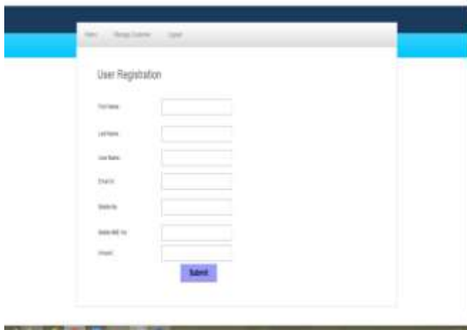
Figure 5.1 Admin User database

Figure 5.2 Explains that when the user wants to access his/her account the user has to enter his/her registered email id and if that matches which the database then the system automatically generates a QR code which the customer can scan and login to his/her account.