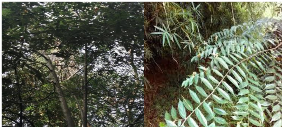
Plate-1. Habit of Pterospermum rubiginosum B. Heyne ex G. Don